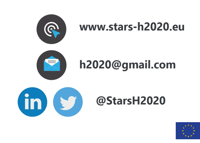
This project has received funding from the Horizon 2020 programme under grant agreement n°769513.

STARS will aim at designing a policy toolkit to provide European mobility stakeholders and policymakers with a support tool based on the results stemming from STARS. It will include guidelines and recommendations to help them make the right decisions and develop the best strategies for environment-friendly and cost-effective car sharing services in European cities.